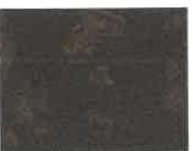
** Rustic Rawhide