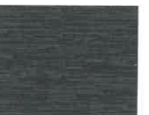
** Black Ore