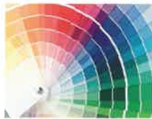
** Custom Color