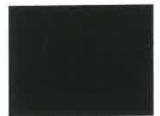
Extra Dark Bronze