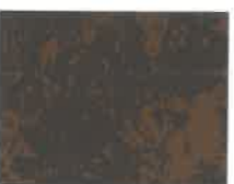
** Western Rust